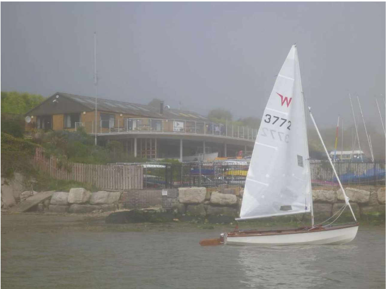
Marie Celeste 2 sighted off the Club