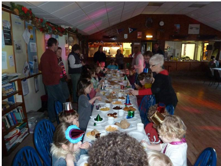
Childrens' Christmas Party