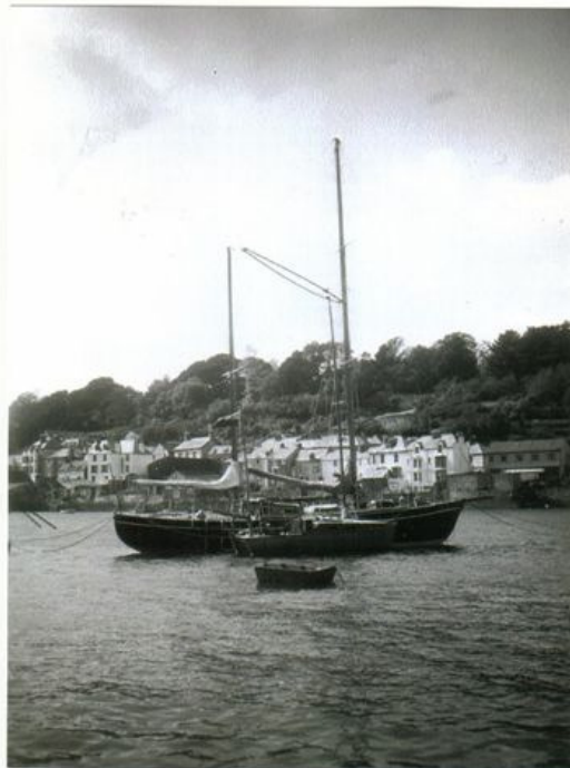
Fortunette—see story on page 9