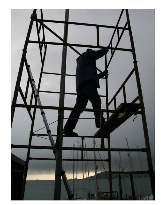
Working party at Castle Cove