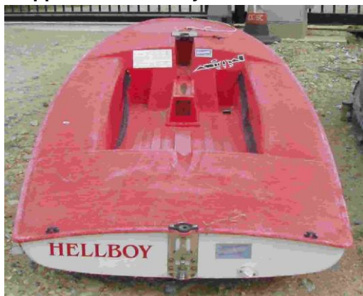
Topper hull – Hellboy