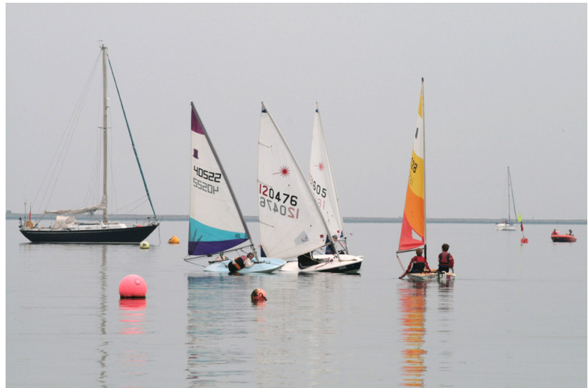
Obstacle Course