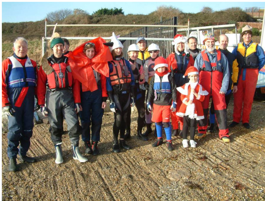
Boxing day race participants