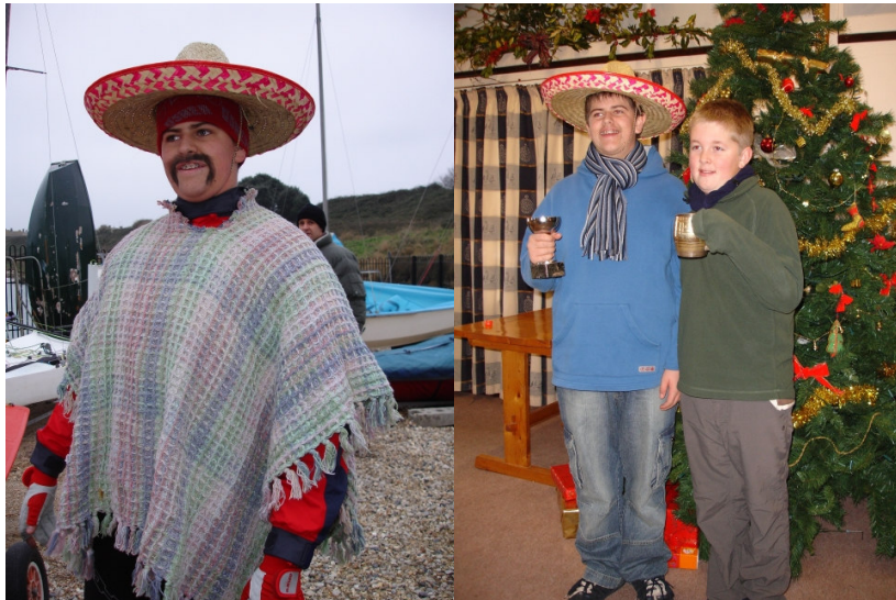
The Boxing Day race winners