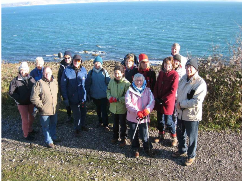
Friday sailors on their walk on Portland