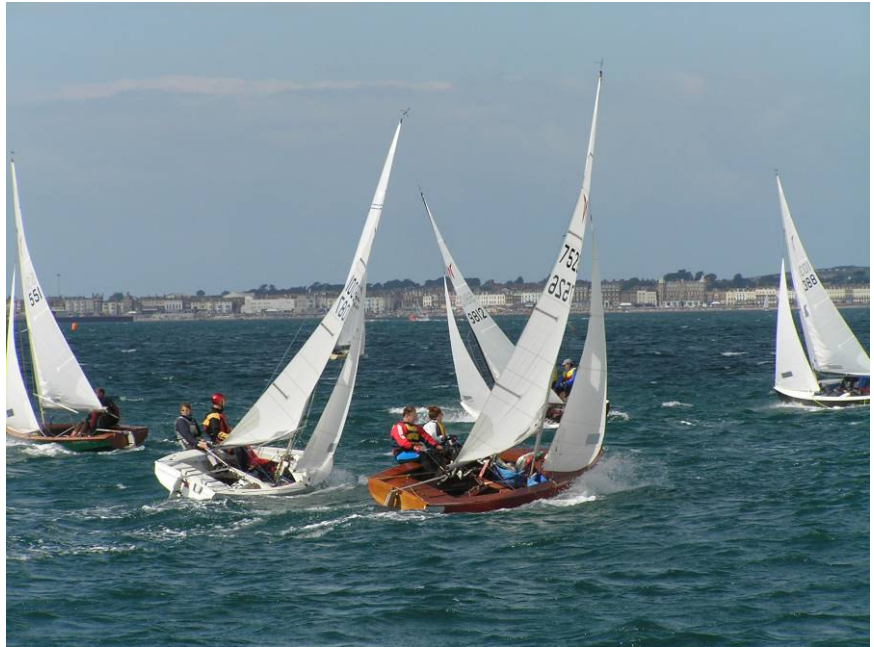
Wayfarer Nationals—25th-27th August