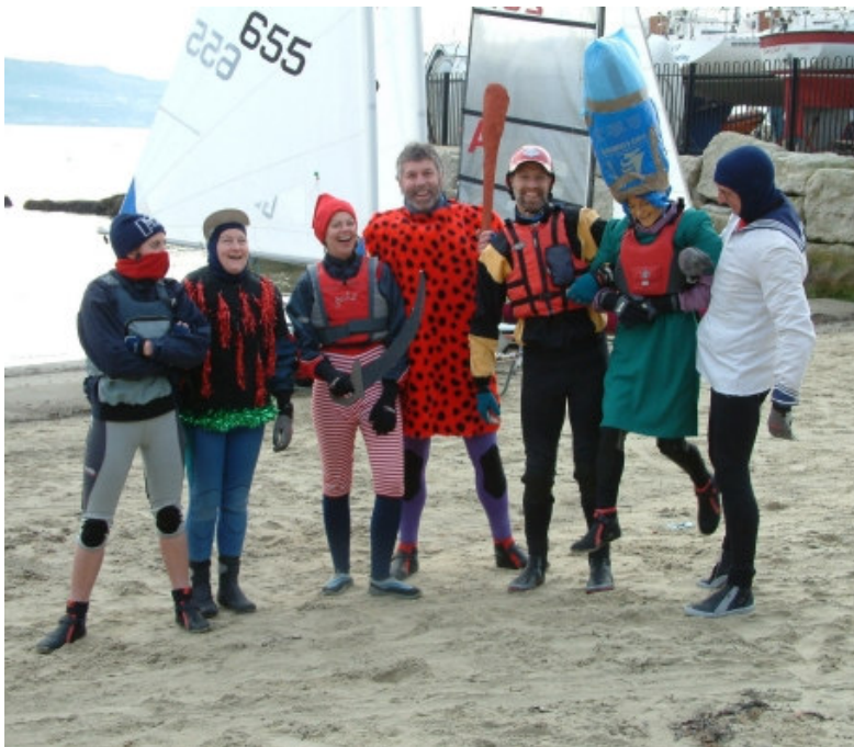
Boxing day fancy dress