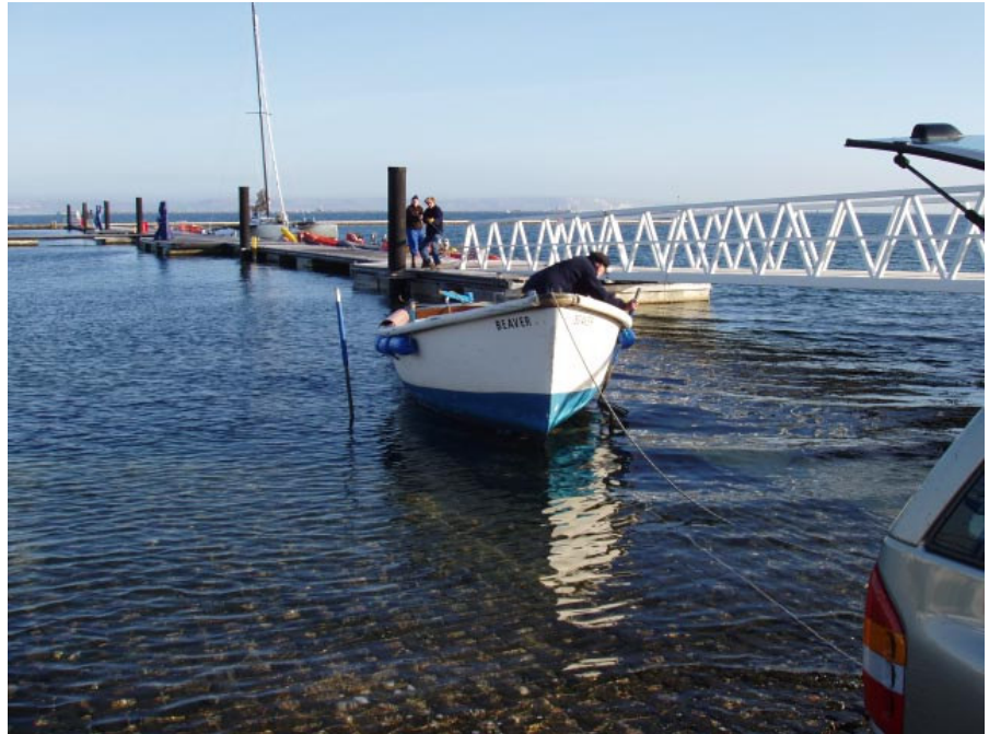
Laying up Beaver