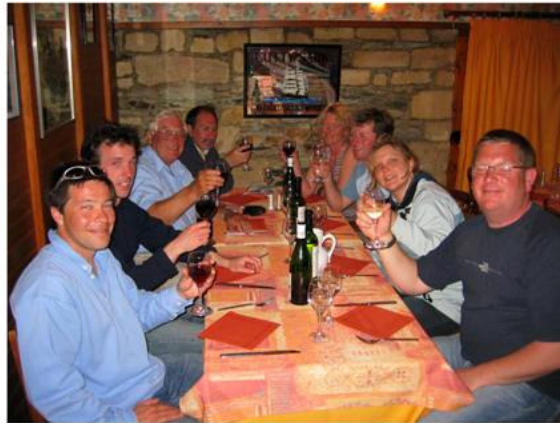
Cherbourg 4 June 2005

6th August Try a boat day Yarmouth race/rally